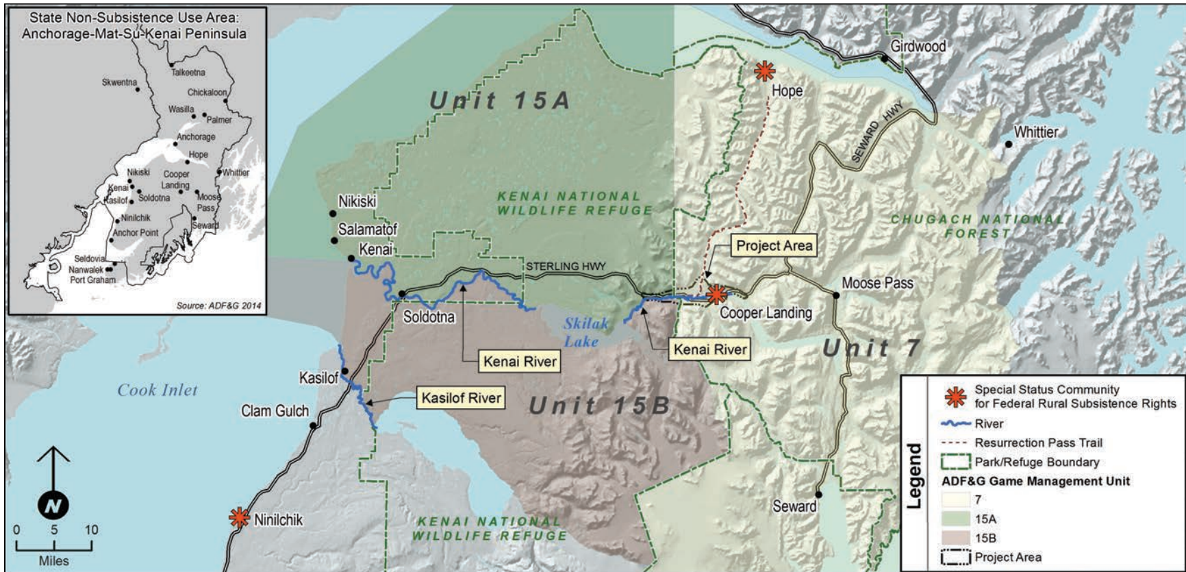
Map 1: Subsistence Overview Map