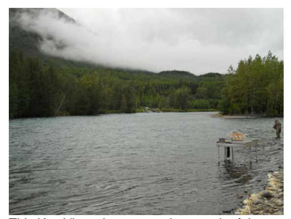
This Key View photo was taken south of the Sportsman's Landing boat launch and Russian River Ferry. The VQE rating for this Key View is moderate