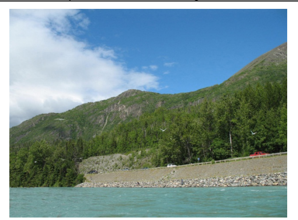
This Key View photo was taken from a raft on the Kenai River looking north toward the existing Sterling Highway, approximately 0.5 mile west of the Russian River Ferry. The VQE rating for this Key View is moderate.