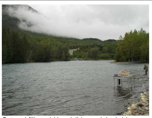
Cut and fill would be visible, and the bridge overpass structure would be clearly visible. The VQE rating for the build condition is low.