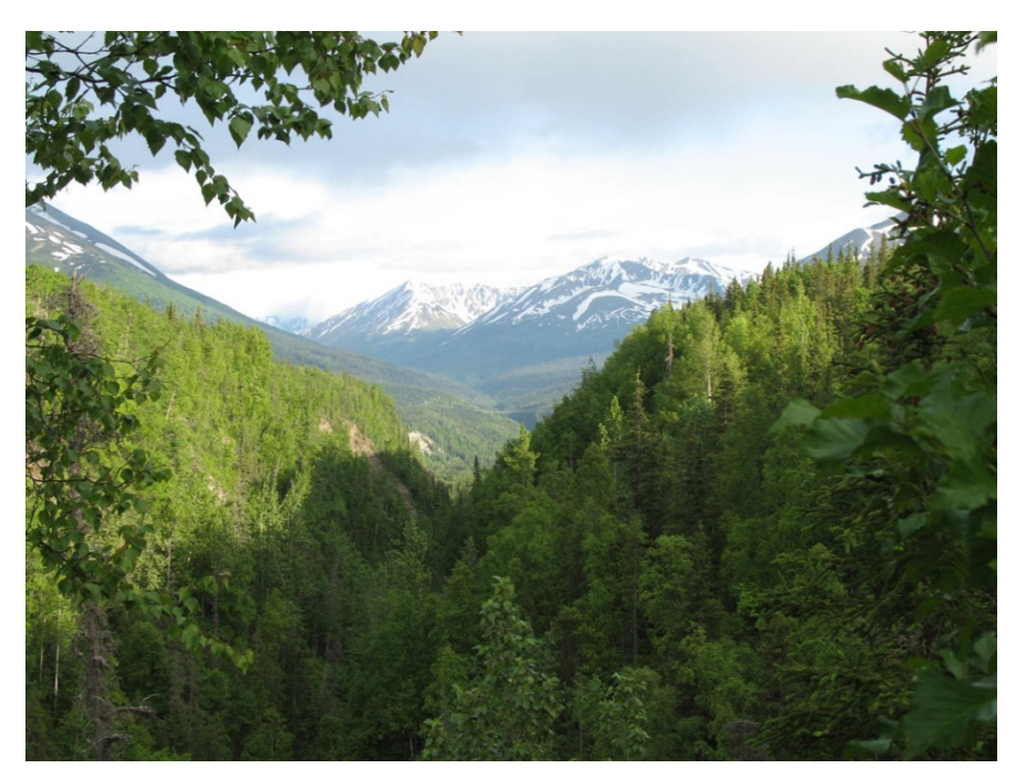
Figure 3.16-2. View from Juneau Creek Falls informal overlook (near Resurrection Pass Trail) looking down Juneau Creek (Key View 12a), an example of views in higher elevations in the project area.