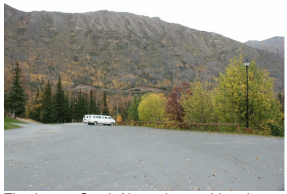
The Juneau Creek Alternative would cut into the lower elevations (600 to 700 feet) of Juneau Mountain where there is no existing development. The VQE rating for the build condition is moderate/low.

3-350 March 2018 Section 3.16 – Visual Environment