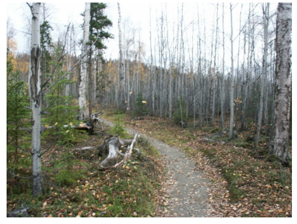
Because an accurate vantage point of this area could not be obtained, no visual simulation was prepared.