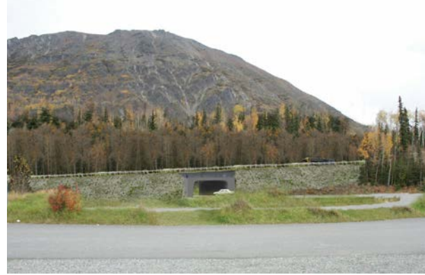
Cut and fill would be visible, and the bridge overpass structure would be clearly visible and close to the viewer. The VQE rating for the build condition is low.