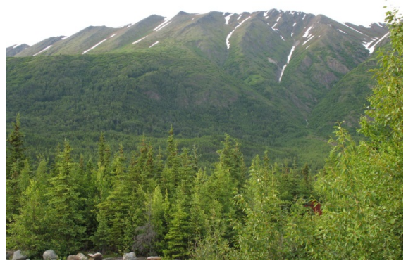
This Key View photo was taken from Snug Harbor Road looking in the direction of the existing Sterling Highway (east of the Cooper Landing Bridge) and toward Juneau Mountain. The VQE rating for this Key View is high.