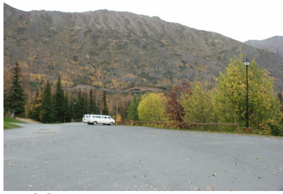
The G South Alternative cuts into the lower elevations (600 to 700 feet) of Juneau Mountain where there is no existing development. The VQE rating for the build condition is moderate/low.