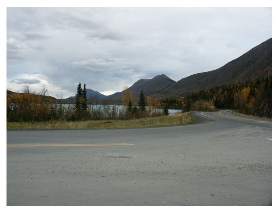
Figure 3.16-1. View from Quartz Creek Road/Sterling Highway intersection at Kenai Lake, looking west (Key View 1), an example of views in lower elevations of the project area.