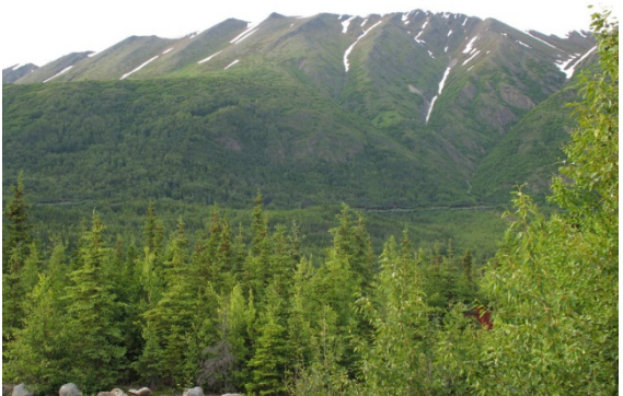
G South Alternative would run across the hillside and be intermittently visible to Snug Harbor Road residents. The VQE rating for the build condition is high/moderate.