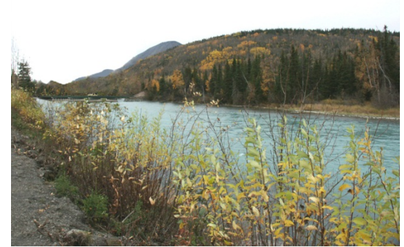
A new bridge crossing the Kenai River would be visible in the distance (left side of this photo simulation). The VQE rating for the build condition is moderate.