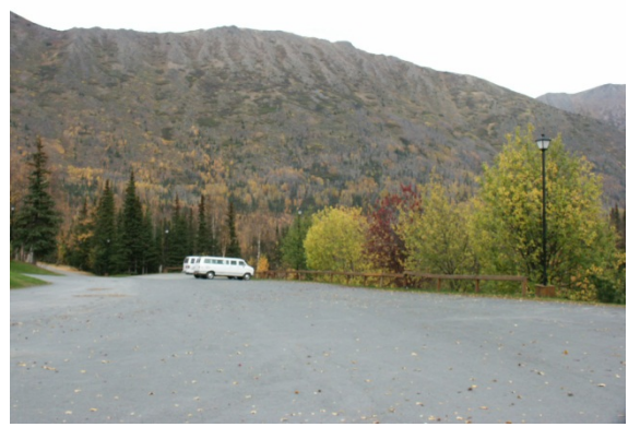
This Key View photo was taken from near the entrance to Kenai Princess Lodge, looking north toward Juneau Mountain. The VQE rating for this Key View is moderate.