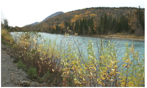
This Key View photo was taken from the south bank of the Kenai River along the existing Sterling Highway facing northwest toward Round Mountain. The VQE rating for this Key View is high/moderate.