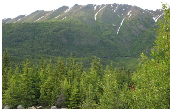
The Juneau Creek Alternative would run across the hillside at a higher elevation than the existing highway and therefore be intermittently within view. The VQE rating for the build condition is high/moderate.