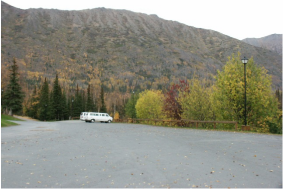
This Key View photo was taken from near the entrance to the Kenai Princess Lodge, looking north toward Juneau Mountain. The VQE rating for this Key View is moderate.