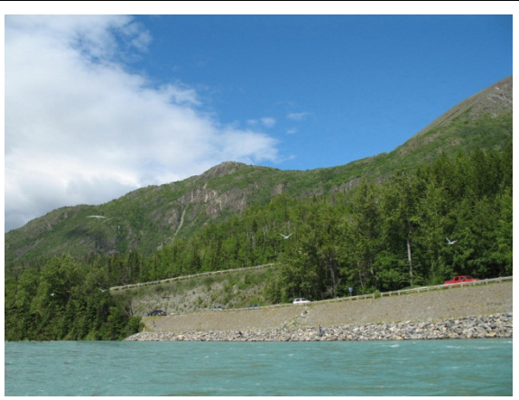
The Juneau Creek Alternative would be seen from this view as it merged with the existing Sterling Highway. The VQE rating for the build condition is moderate.

*Except for Key View 15, the impacts illustrated in these views would apply to both the Juneau Creek Alterantive and the Juneau Creek Variant Alternative. Key View 15 does not apply to the Juneau Creek Variant Alternative. See further discussion of the Juneau Creek Variant Alternative below.