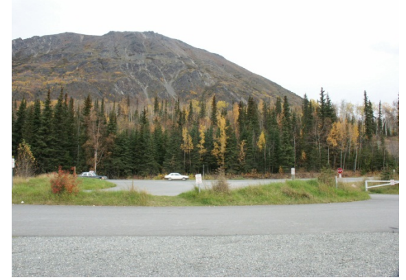
This Key View photo was taken looking north from the Sportsman's Landing boat launch. The VQE rating for this Key View is moderate