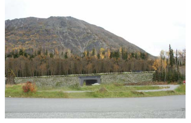
Figure 3.8-1. Existing conditions (top) and simulated conditions at Sportsman's Landing.

The proposed Juneau Creek Variant Alternative would climb to the east and cross over the existing highway. An intersection of the two roads would occur just out of sight on the north side of the new highway.